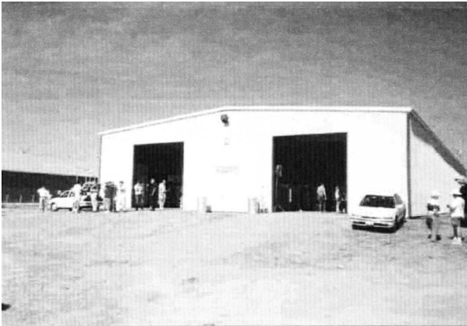
Over 50 vendors, over 300 attendees!