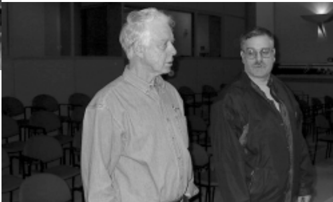
See?! I told you nobody would find this room. Besides. The meeting was yesterday!