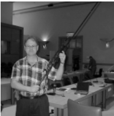
I didn't make many contacts, but you should see the marlin I caught!