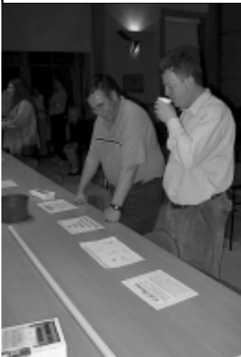
Another cup of this coffee and I may be able to understand this stuff!