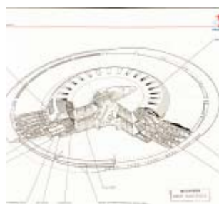
Fig 1 Cutaway of Aircraft Structure

The above illustration was discovered in the pages of a document titled "Project 1794, Final Development Summary Report" (d.1956) The caption reads "USAF Project 1794". However, the Air Force had contracted the work out to a Canadian company, Avro Aircraft Limited in Ontario, to construct the disk-shaped craft. According to the same report, it was designed to be a vertical take-off and landing (VTOL) plane designed to reach a top speed of Mach 4, with a ceiling of over 100,000 feet, and a range of over 1,000 nautical miles.